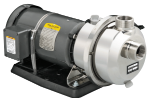
CLOSE COUPLED ELECTRIC

CHEMICALS / WASTES / ACIDS INDUSTRIAL LIQUIDS / OILFIELD AQUACULTURE / AGRICULTURE