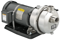
CLOSE COUPLED ELECTRIC

Pump constructed with stainless steel housing. Glass reinforced internal parts, stainless steel housing clamp and internal fasteners, EPDM elastomers and check valve, polypropylene baseplate with close-coupled electric motors, and steel baseplates with close-coupled hydraulic models. Motor shafts are extended with 316SS shaft adapter. Consult factory for polypropylene and Ryton® internal components